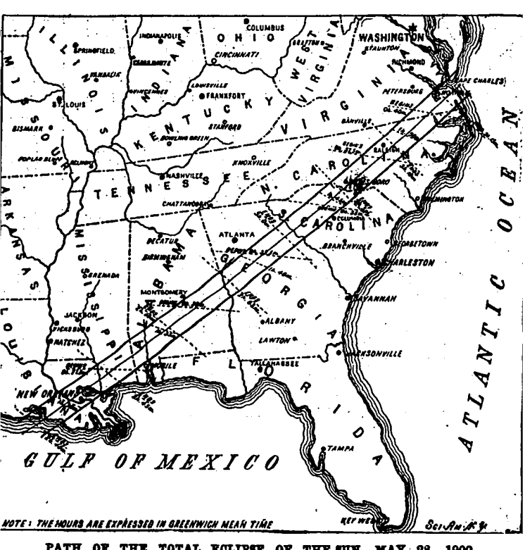
PATH OF THE TOTAL ECLIPSE OF THE SUN, MAY 28, 1900.